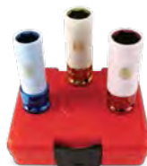
1/2" Drive Impact Socket Sets