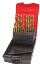
19-Piece Metal Drill Bit Set (Metric - not for North American markets)