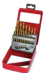
21-Piece General Use Drill Bit Set (Imperial - for North American markets)

To keep your CP tools performing optimally and reliably, we advise the use of CP genuine accessories. From drill bits to impact wrench sockets, CP offers a wide range of accessories to meet all your needs.