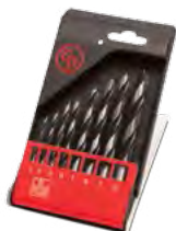
8-Piece Wood Drill Bit Set (Metric - not for North American markets)