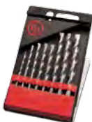
8-Piece Concrete Drill Bit Set (Metric - not for North American markets)