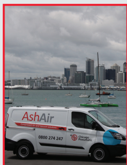
Installation & Servicing

We sell, install, and service air compressors, vacuum pumps, and medical gas equipment. We also build pipe-work systems and make sure that your compressor room is suitable for the compressors to work well.