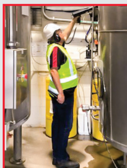
Leak Detection & Energy Audits

Wherever you are when you have a breakdown, our call-out engineer will be there to support you 24/7. We can repair, overhaul and rebuild your air compressors and vacuum pumps, no matter what brand they are.