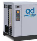
Nitrogen & Dryers