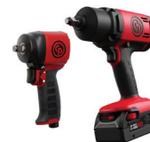
Air Tools & Cordless Tools