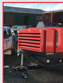
Rental & Emergency Air

With our advanced tools for leak detection and data-logging we can detect leaks and analyse your energy consumption. We'll provide you with an easy-to-understand report, recommend the right solution for your system, and save you money.