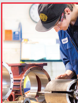
Repair & Overhaul

Regular maintenance on your air compressors ensures that they perform at their best; extending the life of the machines and reduces the risk of breakdown. The parts that need to be serviced regularly are such as air filters, oil filters, oil, and belts.