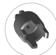
Optimised purge Nozzle

The compressed air quality is of vital importance in many applications even more so in breathing air applications. The applications, such as short-blasting, tank cleaning, tunneling, spray painting and many more require breathing air that is free from contaminants that may be present in the compressed air fed breathing air systems. These contaminants are present in the feed air in the form of fumes, oil, vapors, gases, solid particles and microorganisms.