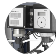
O 2 , CO & CO 2 sensors