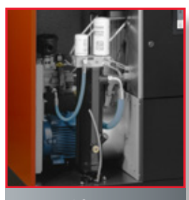
Easy and fast

Insulation foam, deflectors and antivibration pads assure low noise levels.