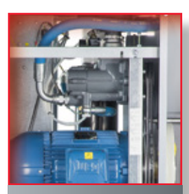
Low noise levels

Add a revised lay-out, a big oil separator and coolers to that and you have a compressor that will grant you total peace of mind. The ideal screw compressor for high energy efficiency and hard working conditions.