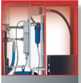
Quality air package

New generation of elements combined with converters & efficient transmissions means high flexibility.