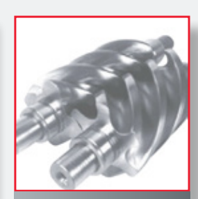
Built to last

Unique control units, specially programmed for Energy Saving.